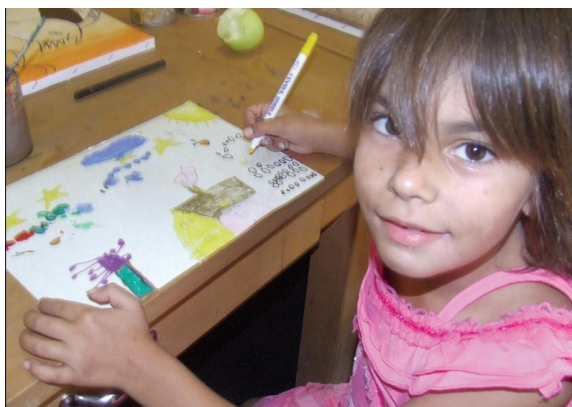
A young artist of Real Pearl Foundation

The investigation with the working title "Can a child drink tap water when thirsty?" reviewed certain issues of ensuring access to water, in connection with the CEHAPE program of the European Union. As a result of close cooperation of the ministries and other relevant bodies the investments of the national drinking-water quality improvement program are scheduled to be finished by 2015 in the municipalities where the tap water quality does not meet the limit values prescribed. Until then it depends on the households' decision, whether they continue to consume the substandard quality tap water, or they decide to carry home the potable water available at outdoor water distribution spots – investing more time and effort. The Ombudsman's report found that parallel with the program to improve drinking-water quality – due to network reconstruction, iron and manganese components, and harmful material of indoor water-drinking supply systems – it is necessary to develop and implement further comprehensive